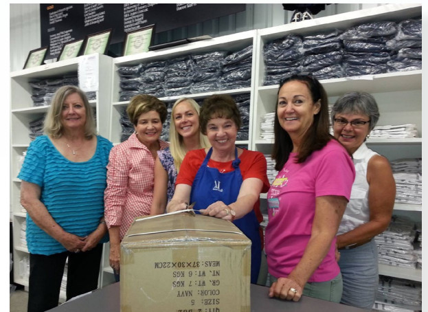
Assistance League of Houston assemble uniforms for children in HCDE Head Start

HCDE Head Start's community partner, Assistance League of Houston, is working hard to prepare for their annual uniform bag stuffing event scheduled for September 24. Over 1,200 HCDE Head Start students will receive a free uniform package that includes polo shirts, pants or skorts, windbreaker, underwear, shoe gift voucher and toothbrush. Volunteers from the Assistance League and the U.S. Coast Guard are assembling the packages. Two events will help celebrate the partnership on September 24. A morning event will be held at Compton Head Start Center from 10-11:30 a.m. Later that afternoon, Pugh Head Start Center staff host a community event from 1:30-2:45 p.m. Media will be invited to the morning event.